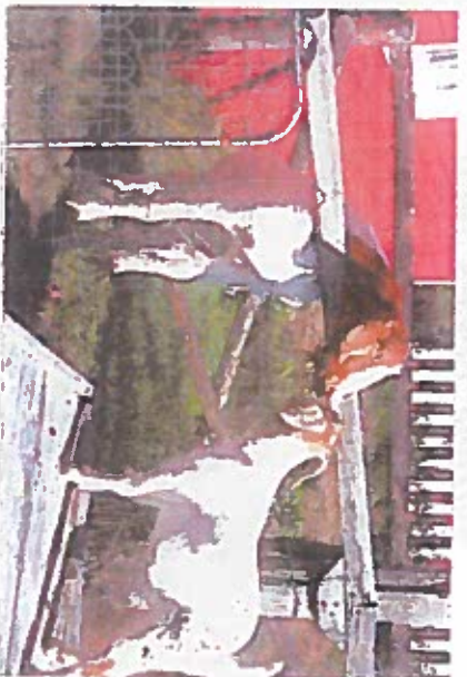
Theodore & Pebbles

Heritage Village in Victoria is operated by the Victoria Heritage/Tourism Society. The Village has a general store, salt box house, forge, post office, barber shop, village hall, fire hall, church, school, railway museum, NL pony barn museum, carriage house and a POW Camp Museum