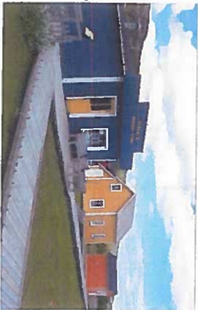
Viola's General Store, Book Store & Post Office