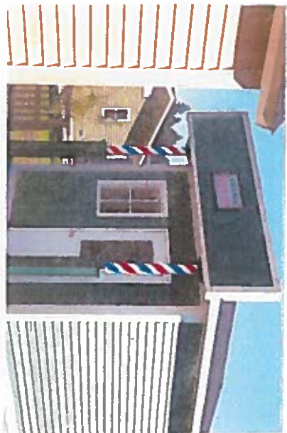
Village Barber Shop