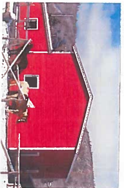
NE Pony Barn