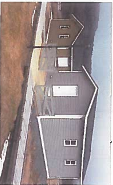
POW & Military Museum