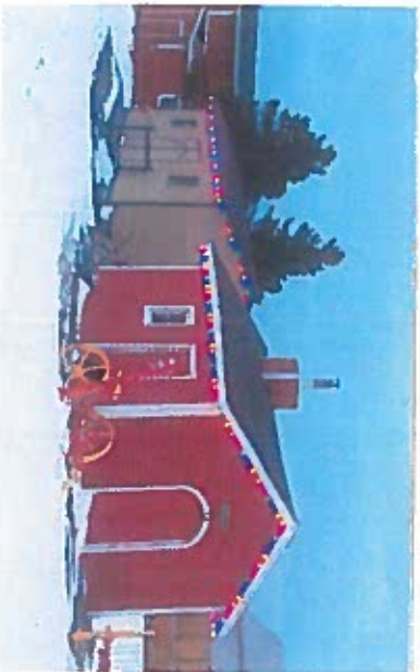
Forge, Workshop & NE Pony Barn