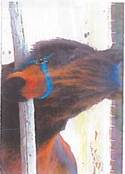
N3 Pony "Jack"